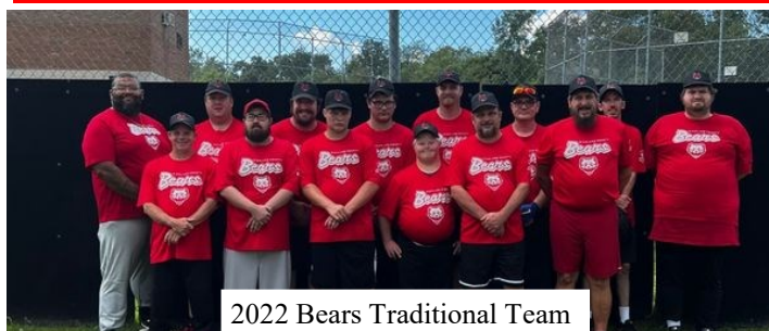
2022 Bears Traditional Team