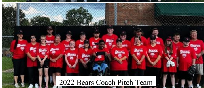
2022 Bears Coach Pitch Team

Both Richland County Special Olympics softball teams are playing games and are having a great season. On Thursday August 18th, teams from Hilliard and Huron County made the trip to take on our Bears. They did not come out with the top scores tonight, but just look at the photos of the amazing smiles on the faces of all the athletes. At the end of the day, these are the moments we will remember. We love these athletes, coaches, volunteers & fans! Go Bears, you are all doing a great job! A few days later on Saturday August 20th, the Richland County Bears played two games in the Mike Piero Special Olympics Tournament in Fremont and came home with the runner-up award in their Division. The Bears softball teams would love to see you at the ballpark, so follow the Richland County Special Olympics page for upcoming games and tournaments and come out and support the local athletes. Their last games will be played on September 6th at 6pm and they will be taking on the Marion Hawks. Best of luck to the Richland County Bears as they close out their softball season.